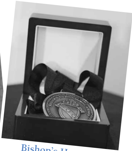
Bishop's Humanitarian Award Medal