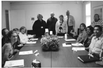
Case managers from CCEVA's Adult and Senior Services attend a memorial service for clients who passed away in recent months.