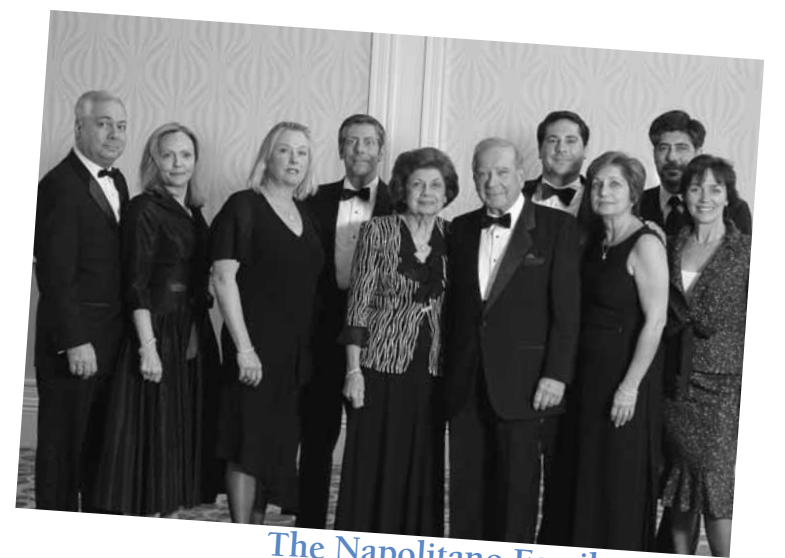
The Napolitano Family