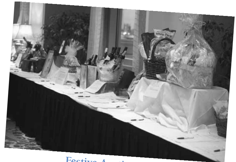
Festive Auction Table